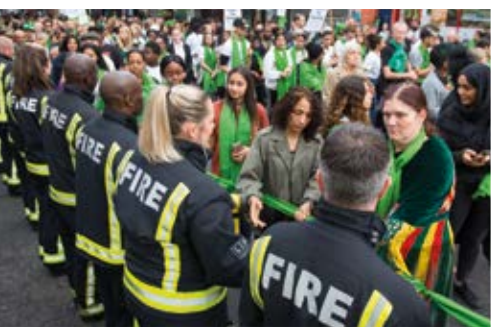
People taking part in the Silent Walk on the evening of 14 June take a moment to pay their respects to firefighters

Silent Walk The Silent Walk makes its way along Ladbroke Grove